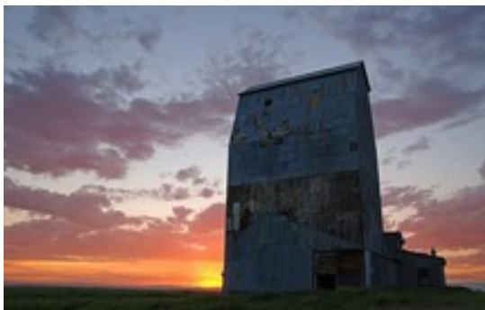
Old Elevator Near Ashton Idaho