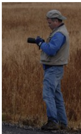
Suggestions for a Field Trip”