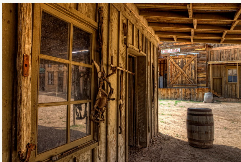
Stable and Street © Michael Fryer