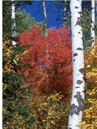
Swan Valley © Amy Kaiser