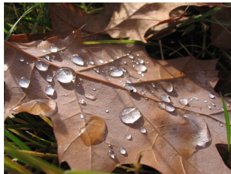
Leaf with Raindrops