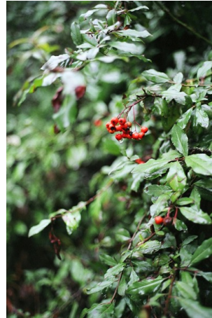
Dominant © Shannon