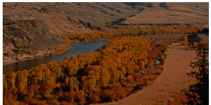
Snake Fall