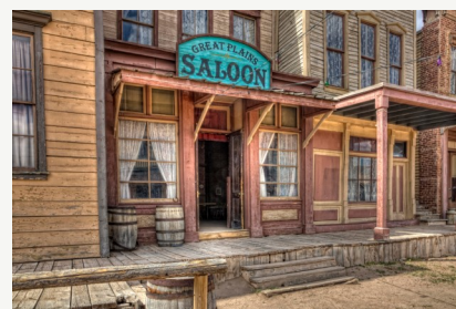
Saloon